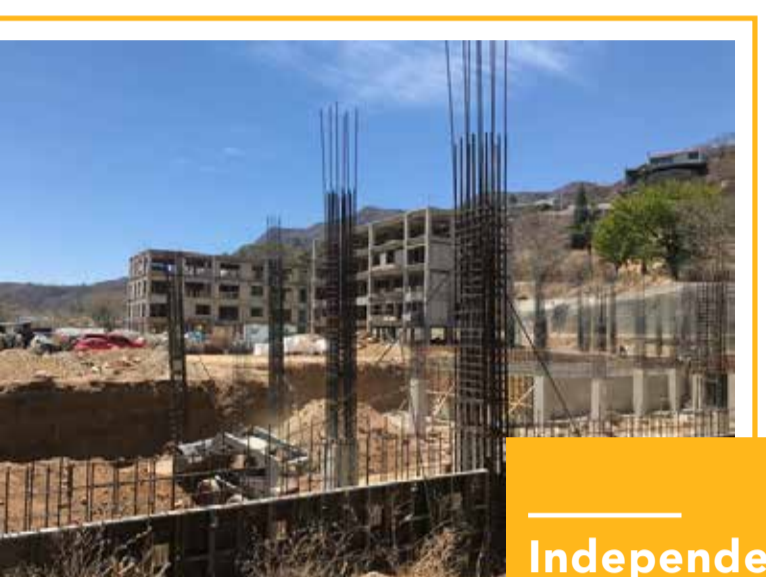
Independent Living Building D & E