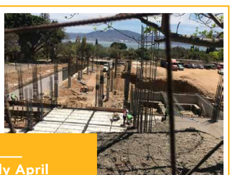
Early April Photos Underground Parking Area