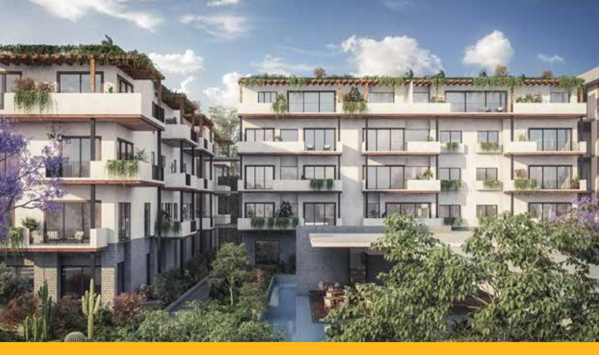
*Independent Living Community & Assisted Living on 2nd floor

We are well on our way with no interruptions or delays in our construction progress and still plan to reach our target opening date. In fact, we are planning to open our Memory Care community the end of this summer with temporary accommodations for Assisted Living in the same building until we complete the main complex.